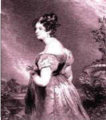
The "Duchess of Bedford"

Non-Profit Organizations U.S. Postage PAID Permit # 919 Westminster, MD 21158